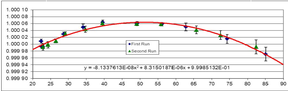
SAMPLE CS-200 TEMPERATURE / RESISTANCE TABLE